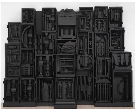
Louise Nevelson, Untitled , 1964, wood painted black.

Boxes. Shoe boxes work great, but boxes of various dimensions and shapes are welcome.